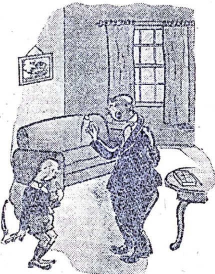
Father: "Never let me catch you smoking my cigarettes again, you young rascal—smoke your big brother's!"

"So do I," said Will Hay. "How pleasant it is, my boy, to be able to please all parties! Now, come with me, and I will lead you to a quiet, secluded spot, where your meditations will not be interrupted till tea-time."