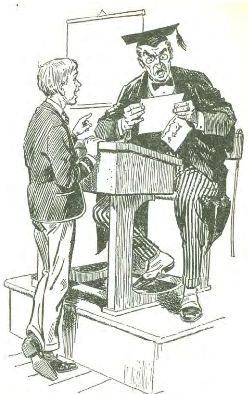
'What! What! You-you dare to jest your Form-master, Todd?'

'Dear me! Have you an Uncle Benjamin, too?'