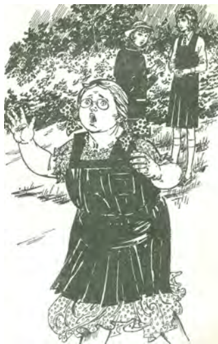
'H-help! It's a ghost!' cried Bessie

Out of the corner of one eye she saw Alphonse Duprez start.