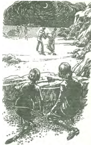
The lifeless figure was dragged across the beach

But inch by inch they descended, finally reaching a little veranda of rock ten feet above the beach, and entirely hidden from the view of anyone below by the jutting balustrade of chalk rock which hemmed it in on the sea side. Together they rose, peering over.