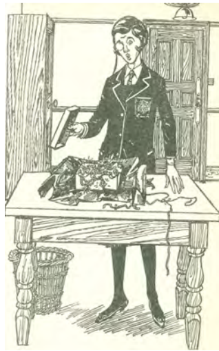
The box was full of jewels - and all of them stolen

Marcelle hesitated. She glanced at the parcel on the table, then at the clock. As Jean said, she would have to hurry, for she had to change, and, as the buses were not running to-day, she would have to walk to Friardale Station - a good twenty minutes, even if she took the shortest cut. Jean's assistance, in her present excited frame of mind, would save her a great deal of worry and trouble.