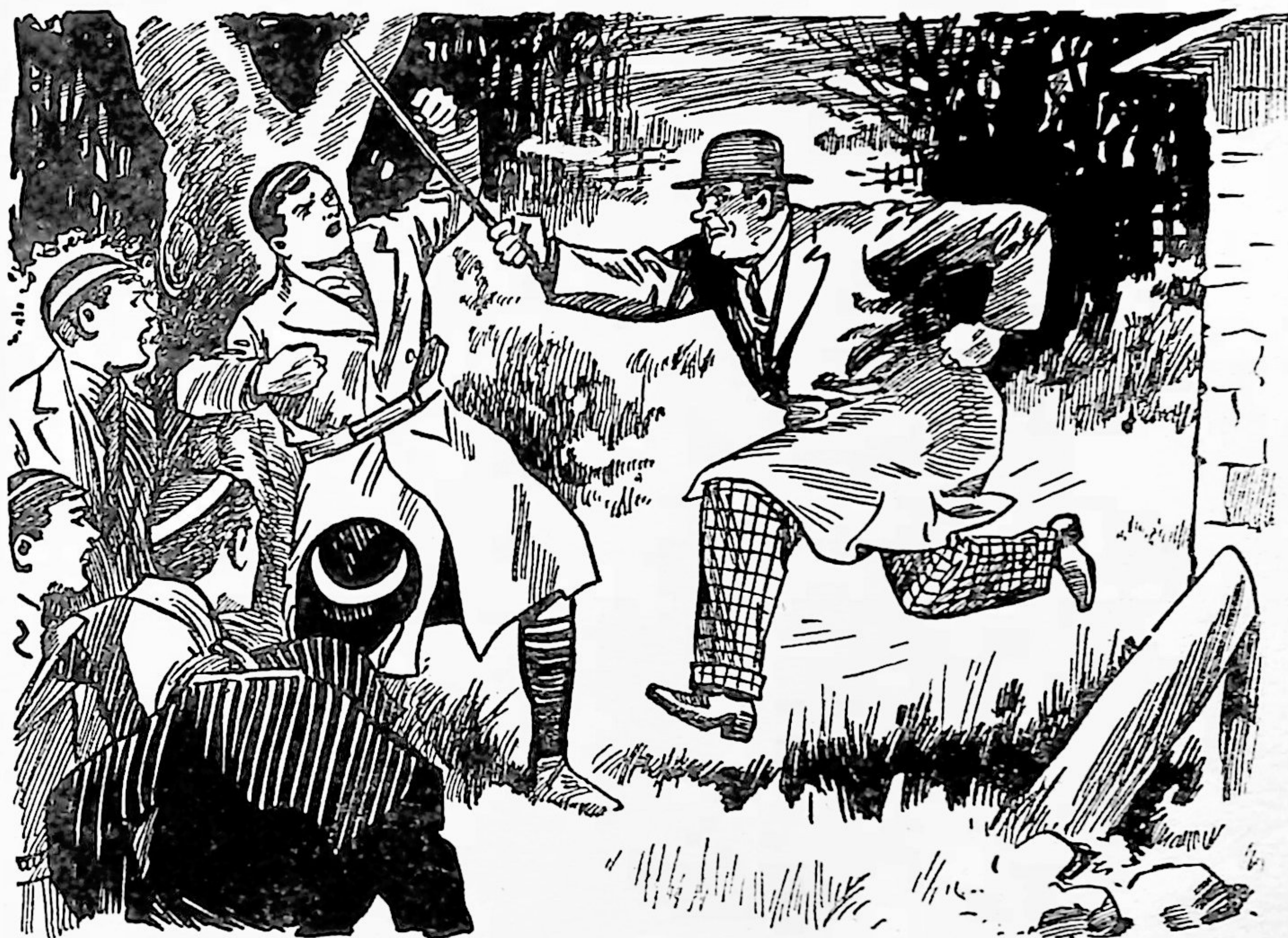
Mr. Rawlings slashed out furiously with his stick, and Johnny Bull caught it on his arm and grunted with pain. But the bookmaker did not have time for more than one blow, for he was gripped by five indignant juniors, and he went sprawling on the ground.

"You must explain to me, Wharton. You have denied that you owed the man money, but your signature to this paper bears out that part of his statement. I would not accept his word on any matter, of course, but there is your signature. You owed him money, yet you have denied it."