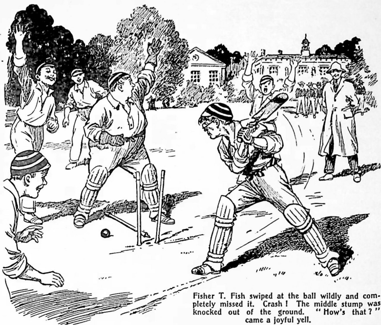
Fisher T. Fish swiped at the ball wildly and completely missed it. Crash! The middle stump was knocked out of the ground. "How's that?" came a joyful yell.

me some messages for your sec. But I guess I've really come over to see you."