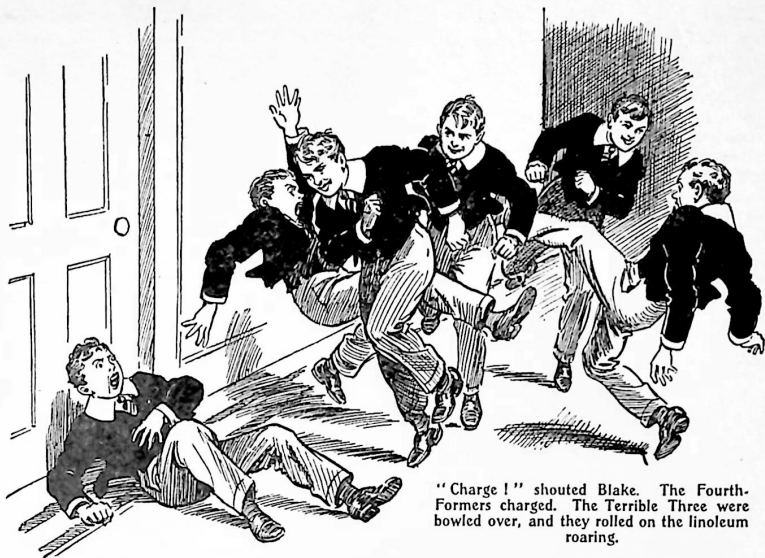
"Charge!" shouted Blake. The Fourth-Formers charged. The Terrible Three were bowled over, and they rolled on the linoleum roaring.

Tom Merry turned his pockets inside-out in eloquent response. Monty Lowther extracted a bad threepenny-piece from his pocket, gazed at it sadly, and put it back again.