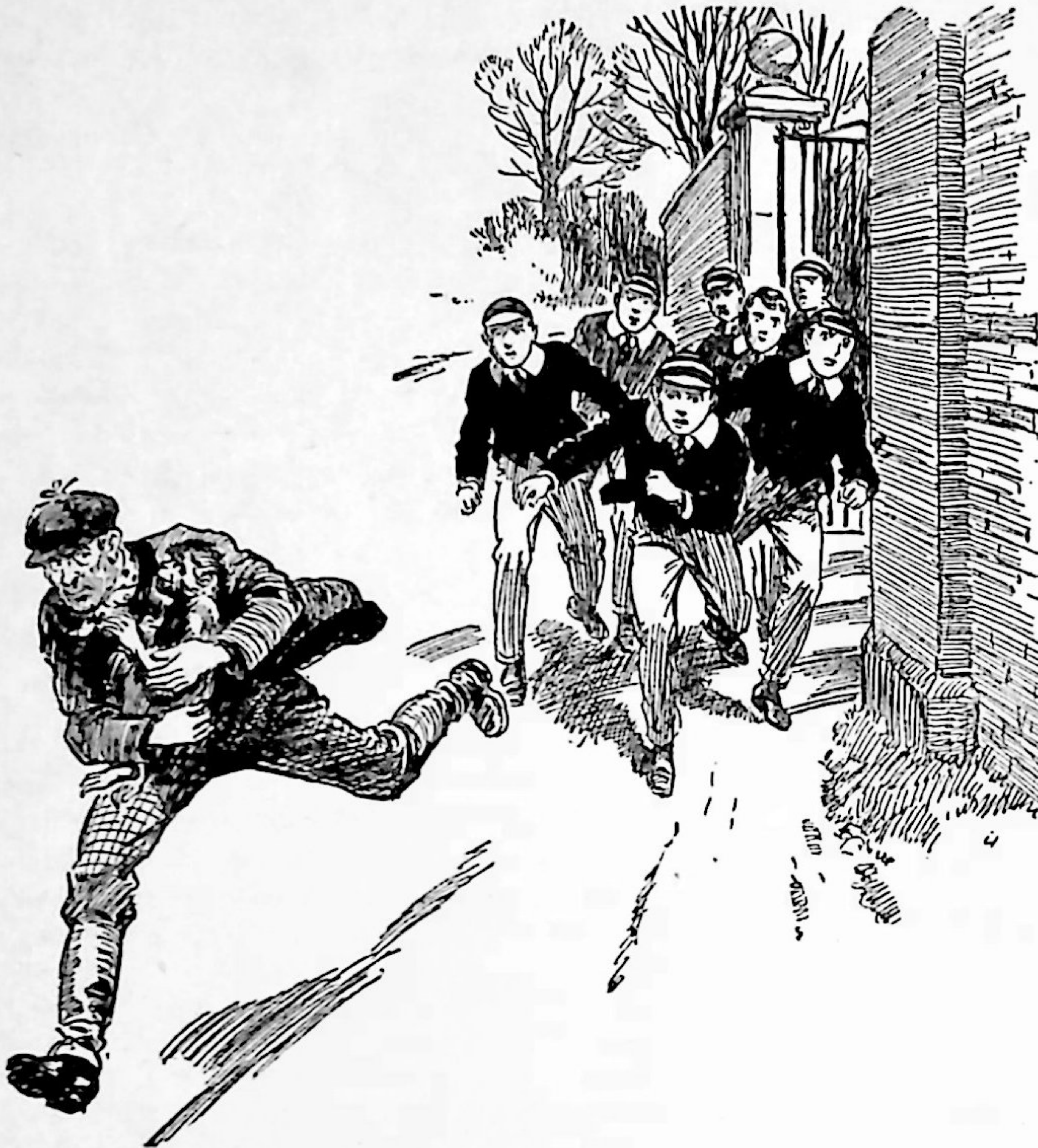
Fur Cap dashed down the lane at top speed, clutching the trembling Mike. "The rotter! He's stolen the monkey!" shouted the juniors, as they sped after him in hot pursuit. (See Chapter 7.)