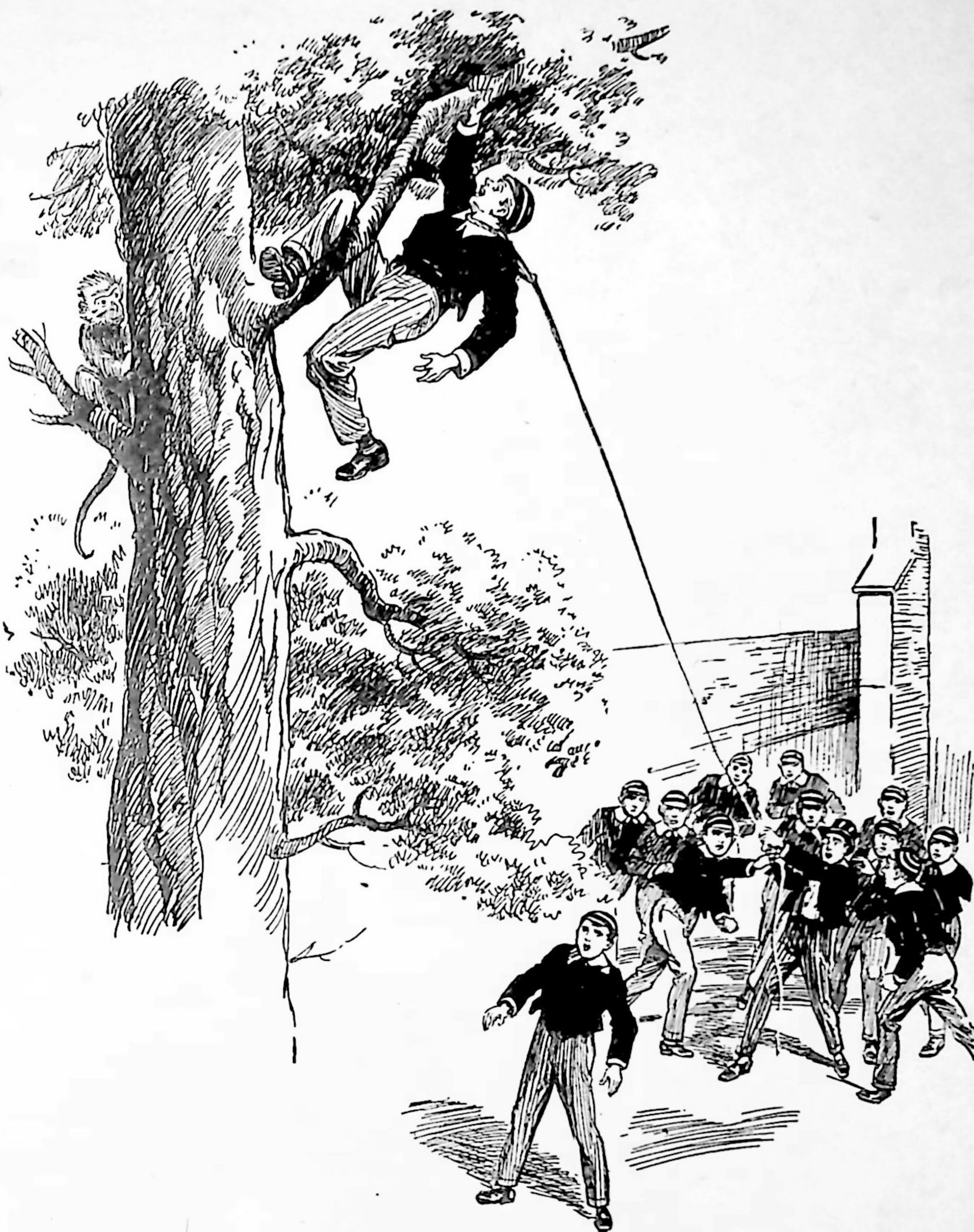
Tom Merry clung desperately to the branch. The juniors rushed at D'Arcy and forced him to slacken his efforts. "You dangerous ass!" spluttered Blake. "Are you trying to hang Tom Merry?" (See Chapter 6.)