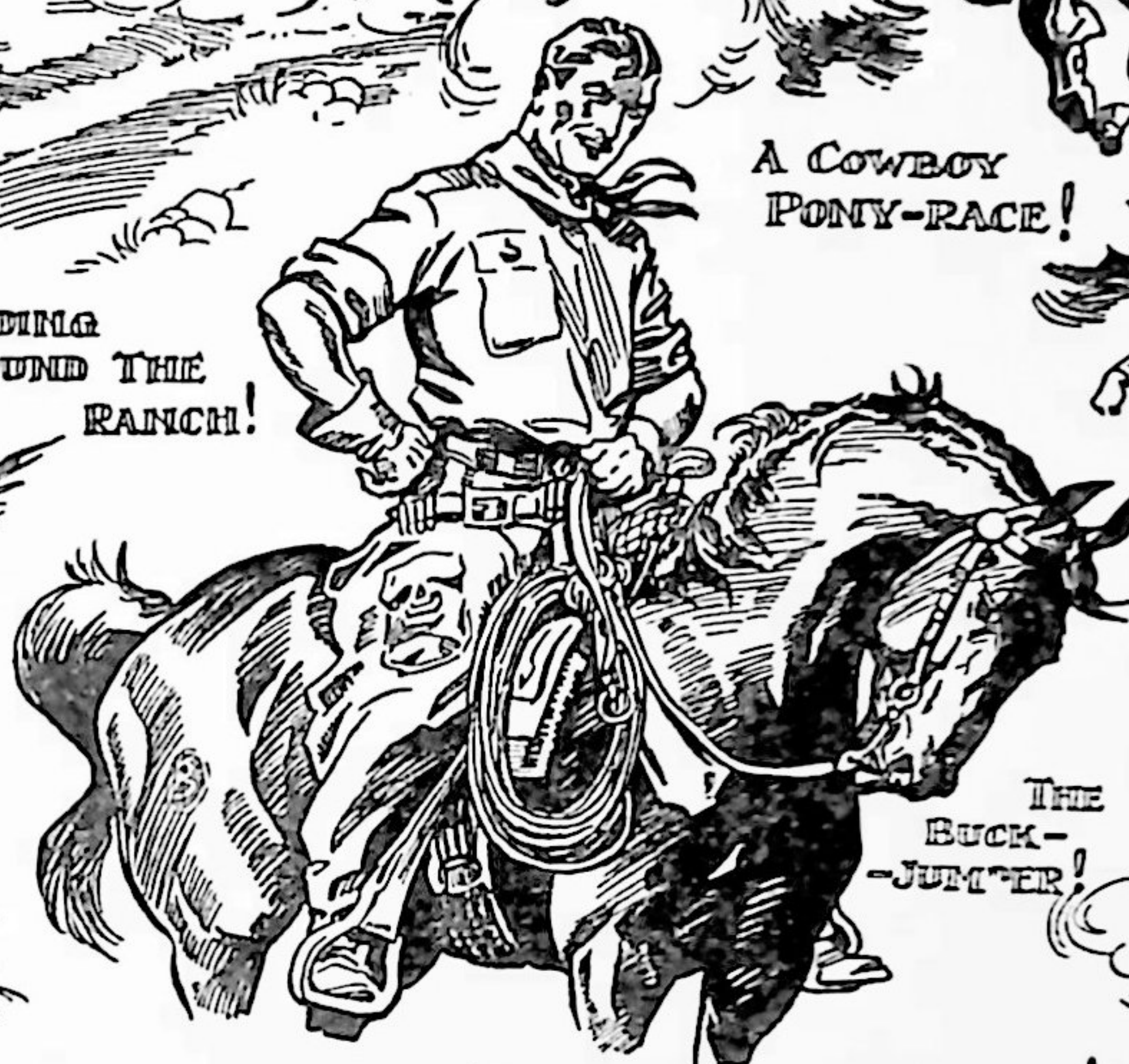
THE BUCK- -JUMPER!