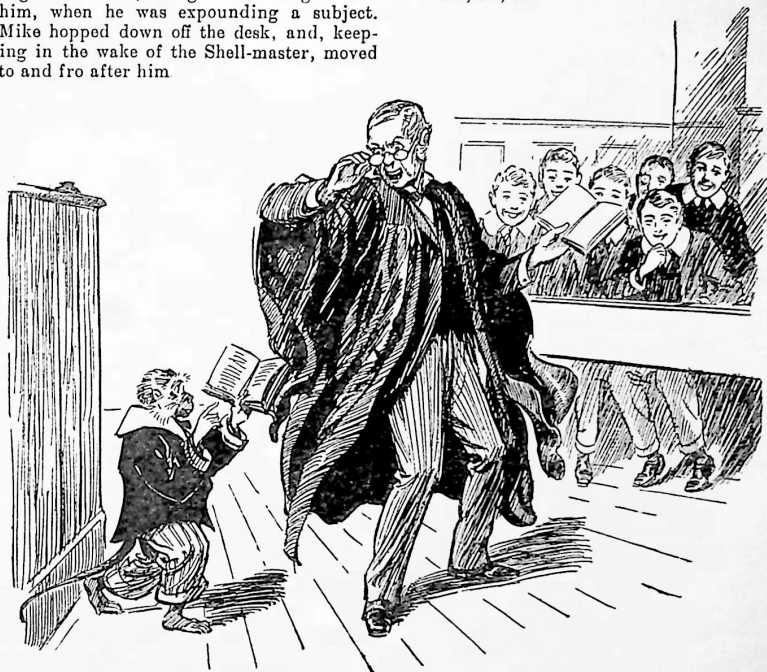
Mr. Linton spun round and saw Mike. He was strutting up and down holding the book with his left paw, and making gestures with his right. "G-g-goodness gracious!" gasped Mr. Linton, turning purple. (See Chapter 10.)