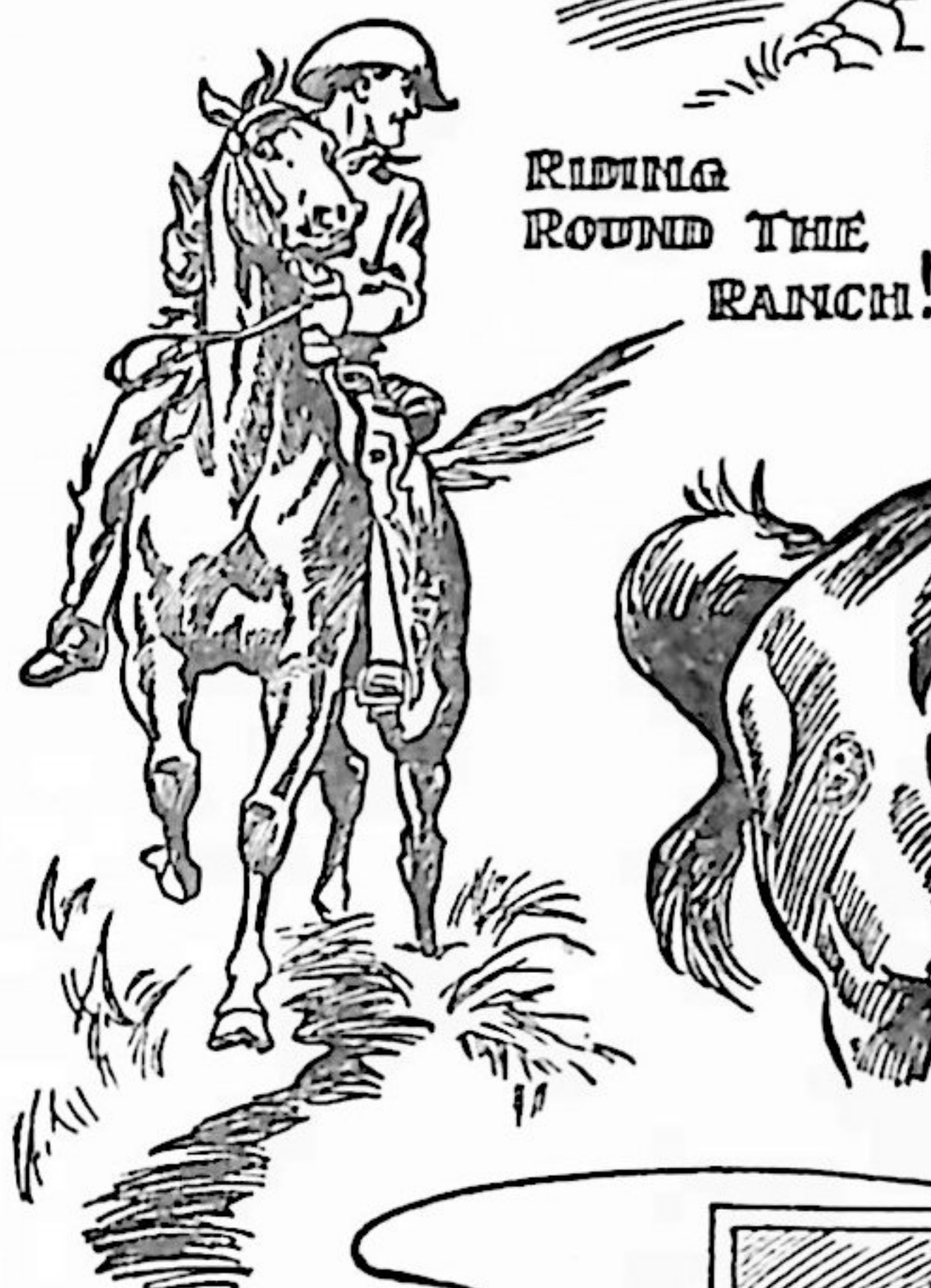
RIDING ROUND THE RANCH!