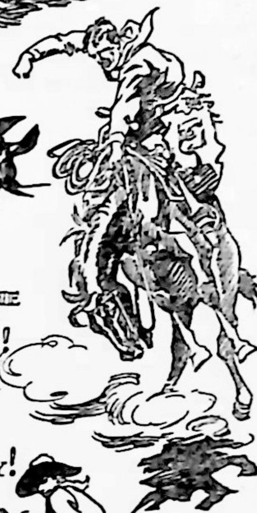
A TYPICAL MODERN COWBOY!