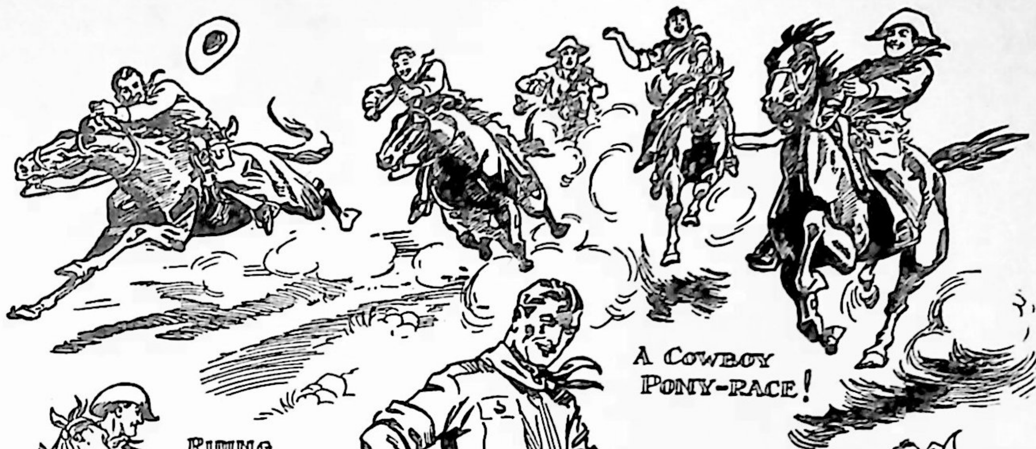
A COWBOY PONY-RACE!