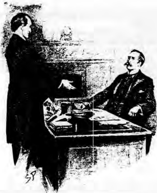
SHERLOCK HOLMES WAS STANDING SMILING AT ME ACROSS MY STUDY TABLE.

there appears to be some attempt - at first, anyway - at chronology. the early stories in 'The return' give ample scope for dating the events. In 1894 Holmes arrived back to start his second life by solving the affair of Colonel Moran. ("Good to see you back, sir!" remarked Lestrade).