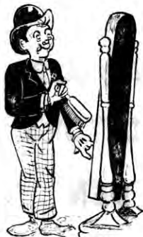
AUGUSTUS TOPPING -CARETAKER