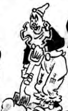
MERRY AND BRIGHT