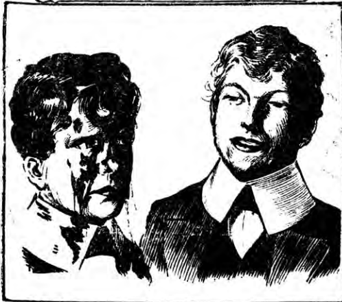
HE WAS REALLY SORRY, BUT COULD NOT HELP LAUGHING.