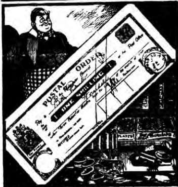
BILLY BUNTER'S POSTAL-ORDER ARRIVES—AT LAST!