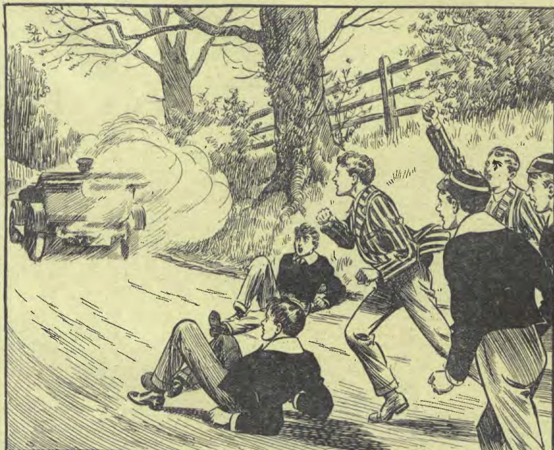
The car containing Joey Hook whipped down the road, leaving nothing but a cloud of dust and a smell of petrol for the enraged and disappointed Rookwood fellows.

"What on earth does it mean?" exclaimed Raikes. "When was that letter given to you, Neville?"