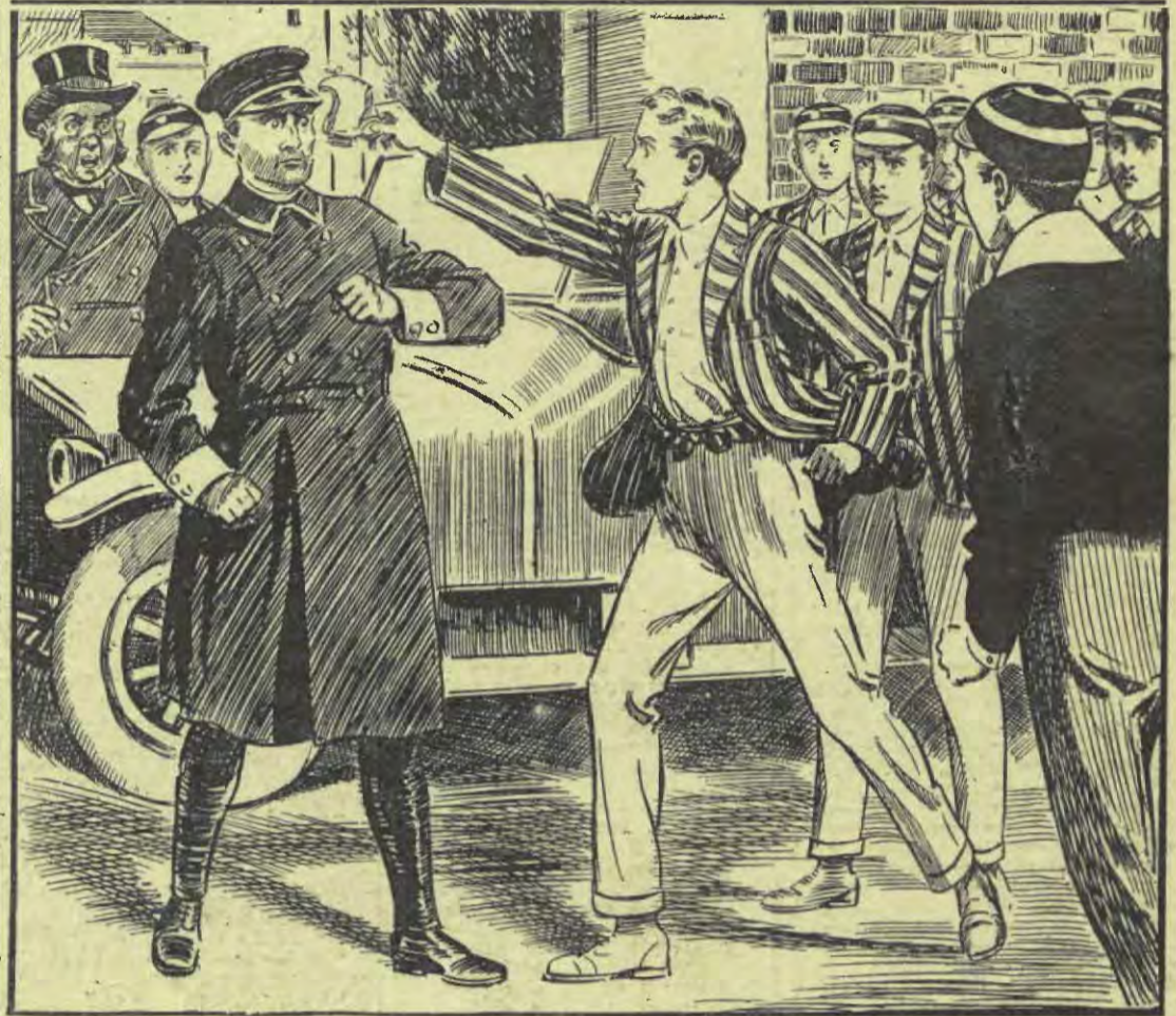
Bulkeley dragged the goggles away from the chauffeur's face. "Jocoy Hook!" he exclaimed. "What does this mean?"

But he was not allowed to escape. The three Tommies were keen to