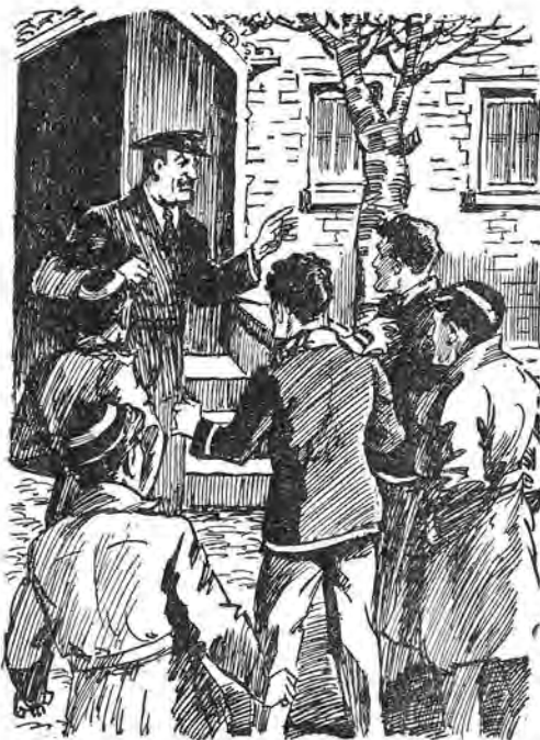
The Inspector talks to the Famous Five

The lapse of more than twenty-four hours had brought no news of the missing Owl. It was known that he had not gone home. It was known that he had not been seen at any railway station within a wide radius. Where he was, was just a mystery that nobody would guess. But at the sight of Inspector