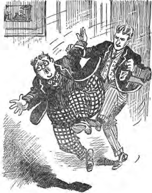
... After him rushed the Bounder, still booting

Billy Bunter disappeared round a corner. He left a crowd of fellows in the Rag laughing. But the hapless fat Owl was not feeling like laughing. The Bounder's foot had landed hard. And there was more to come! Somehow or other, the fat grub-raider of the Remove never expected to be called to account for his innumerable sins. But he was called to account now and the outlook was gloomy. No more frowsting in an armchair before the fire in the Rag, for Bunter, so long as Smithy was there. He had to steer very carefully clear of Smithy—unless and until he could restore the box of chocs pilfered from No. 4 Study! And that box was confiscated—in Quelch's study! Not for the first time in his fat career, Billy Bunter realized that the way of the transgressor was hard!