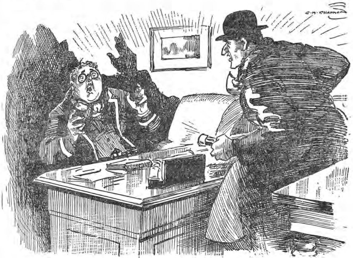
He made a single stride towards Billy Bunter

Billy Bunter opened his mouth for a yell. He did not care if Quelch caught him in his study, now: indeed, the sight of Quelch coming in would have been the gladdest sight he could have beheld. But he had no time to utter that yell. Strong hands grasped him, and a hand was clapped over his mouth. What happened next Billy Bunter did not know, for at that moment he fainted away from sheer terror.