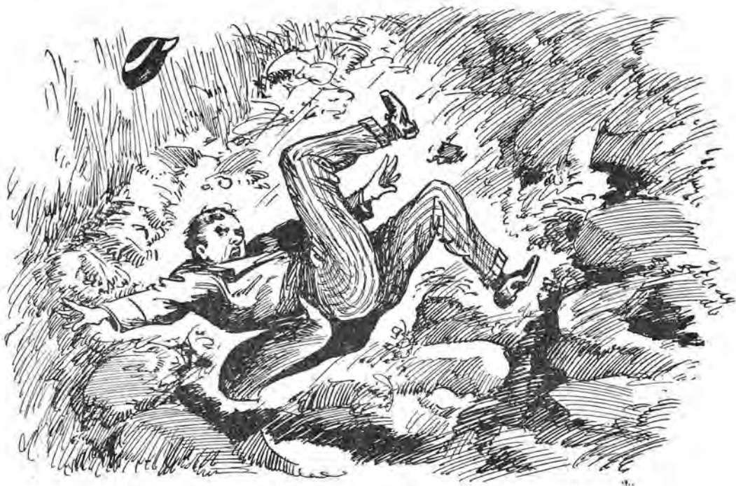
Smithy shot downward into darkness

The chill of the snow packed round him was already penetrating his overcoat. He had to get out of this, or freeze. He had to have help—but who was to hear a shout for help, in that lonely glade in the middle of a frosty wood? Only the man of the caravan, whom he had fled to escape!