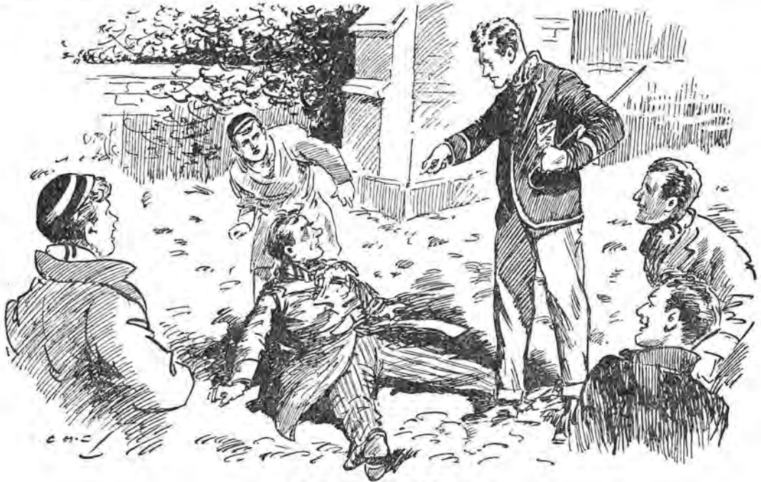
"Stop that!" rapped Wingate

"By gum!" said Bob Cherry, with a whistle. "So that's it! Same thing over again—but the Head's study this time."