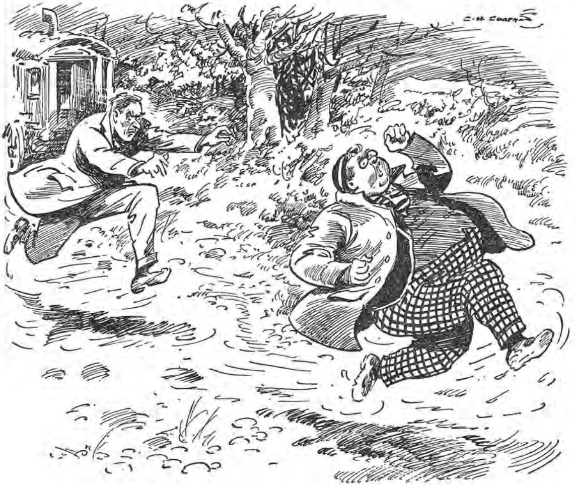
He charged after Bunter

not bear thinking of. Bunter bounded up and ran. He heard an angry roar behind him, which spurred him on. Seldom or never, in his fat career, had Billy Bunter put on such speed. For once, if for once only, Billy Bunter looked as if he would have quite a good chance for the School 100-yards. An angry caravanner, standing on one leg, holding a painful shin, glared after him from the van, as he vanished into the snowy distance. For some moments, he rubbed that painful shin. Then he leaped from the van, and charged after Bunter, and the expression on his face as he charged was positively ferocious.