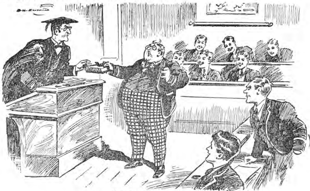
... Only to hand it over to a beak

"Bunter! You have been punished before, for bringing comestibles into the form-room!" rumbled Mr. Quelch. "Bunter, this box of chocolates will be confiscated. I shall take it to my study after this class. It will be returned to you, Bunter, at the end of the term. I shall now cane you, Bunter, for having brought it into the form-room during lessons."