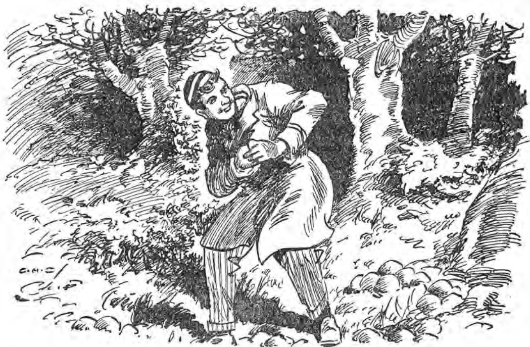
He had a good supply of ammunition

You put fellows backs up by putting down what happened in Quelch's study to Bunter, and you really asked for it—”