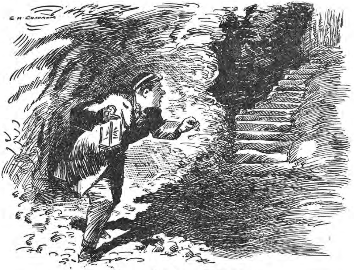
Smithy tramped up the steps, winding upward

The steps ended abruptly. He stood at the top, circling the light round him. To right and left were the walls of clammy stone. In front of him was what