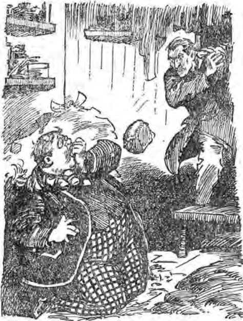
Dexter tossed Bunter half a loaf

When his meal was over, Dexter looked out at the door again. Then he turned scowling to Bunter, and threw him half a loaf.