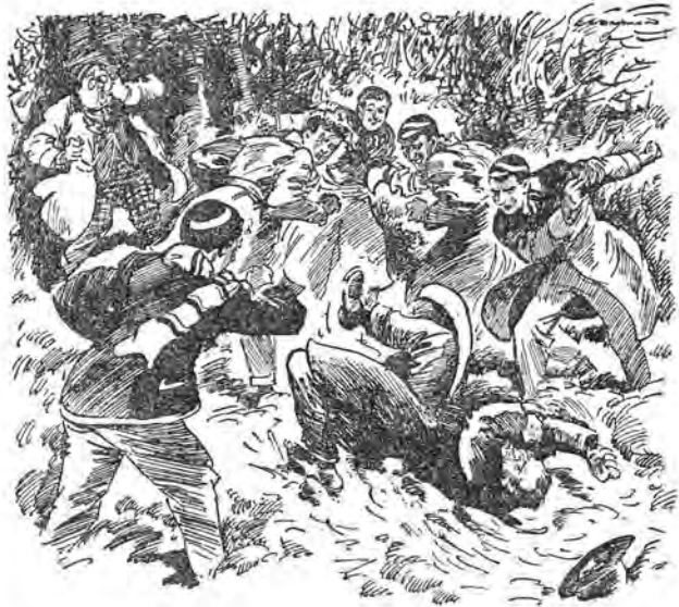
The angry caravanner . . . crashed headlong into the snow

It looked, for a moment, as if the enraged man would rush at them, hitting