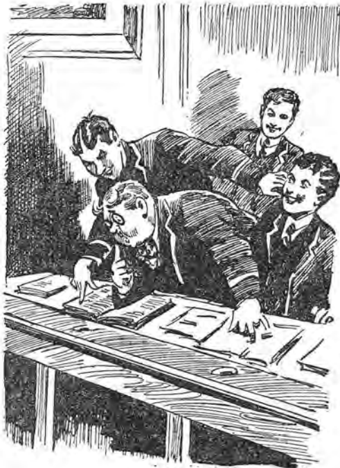
Vernon-Smith leaned over

"Oh, my hat!" murmured Bob Cherry, and there was a suppressed chuckle in the Remove. Bunter could always be relied upon for a "howler". This was one of his best.