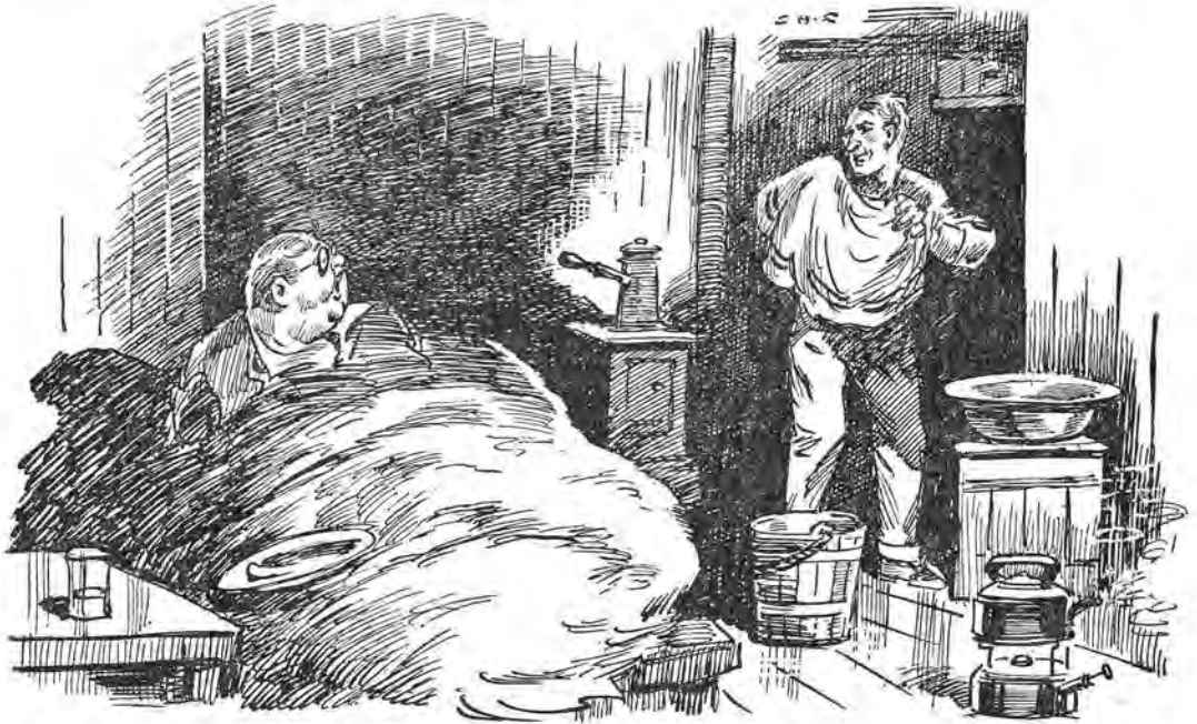
The fat junior sat up in the blankets

It seemed, to Billy Bunter, that he had been ages and ages a prisoner in that shabby, wretched caravan. But he was aware that this was only the second day of his imprisonment there. The hours seemed endlessly long—it was like a prolonged nightmare. Worse, if possible, was the anticipation of what was to come. How long was he to be kept there, a prisoner on short commons; tied up like a turkey when the brute was absent, scowled at or cuffed when he was at home? How was it going to end?