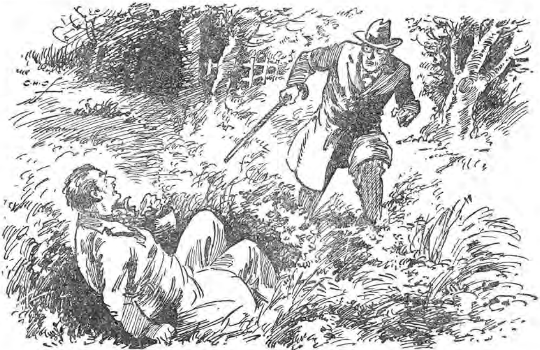
The Remove Master looked down at him

"The matter is now clear, Dexter," he said. "You will be detained, and handed over to the police, on a charge of kidnapping and robbery. You were in my study at midnight, on Thursday, when that foolish boy Bunter came down, and you kidnapped him to keep him silent. You were aware of the secret of that old well, which was discovered this afternoon by Vernon-Smith, a boy of