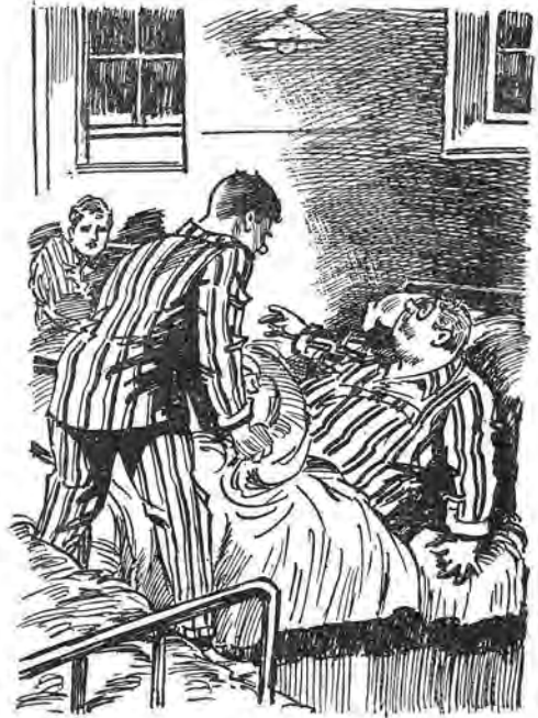
"Time!" said the Bounder's voice