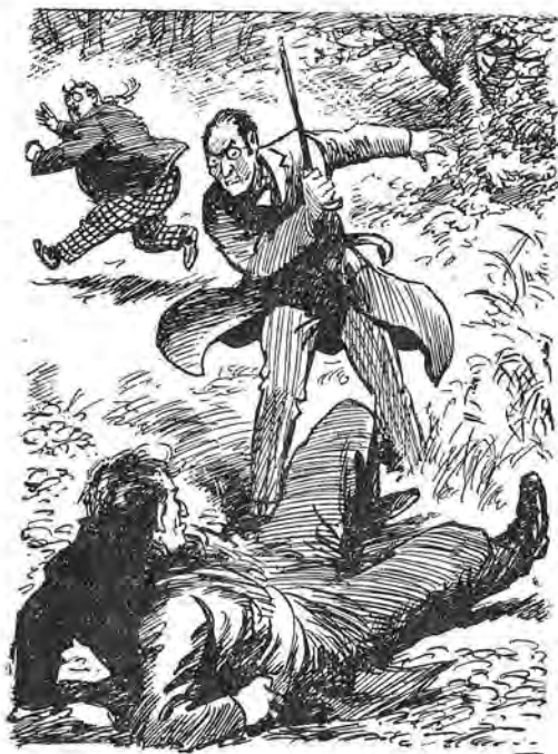
The Remove Master struck with his stick

The captain of the Remove had never put up such speed on the football field. He fairly flew across the little glade, his comrades at his heels. It was only then that James Dexter discovered that there were others on the scene. He discovered it, as he was grasped on all sides, and dragged away from Mr. Quelch, rolled over in the snow, and pinned to the earth in the grip of many hands.