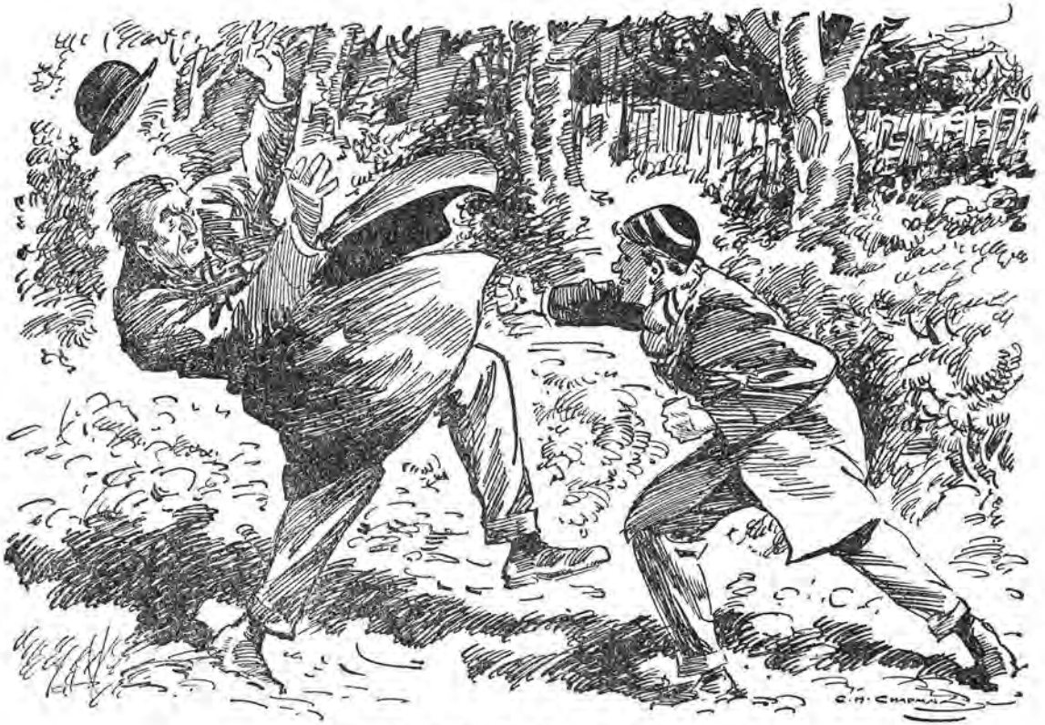
Fortunately for Smithy, the man's foot slipped