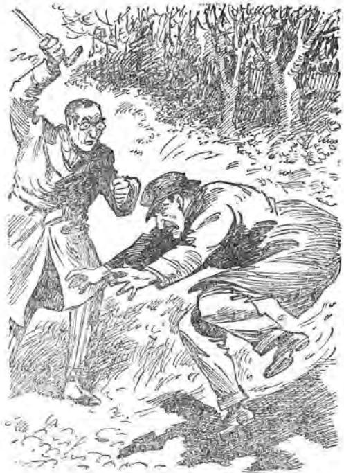
It came down . . . with a crash

Quelch looked like following him into the wood, for a few more swipes. But he checked himself: no doubt remembering that such a chase would not be in accordance with the dignity of a form-master of Greyfriars. He cast a gorgon-