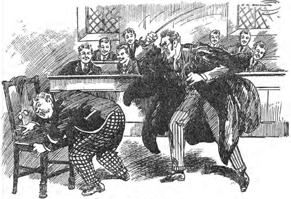
Dismally Bunter bent over