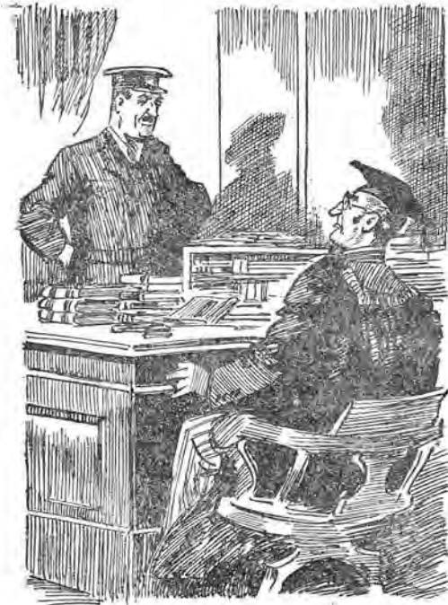
Inspector Grimes talks to Mr. Quelch

His only consolation was, that the missing junior must soon be found and brought back to the school. Whether the missing money