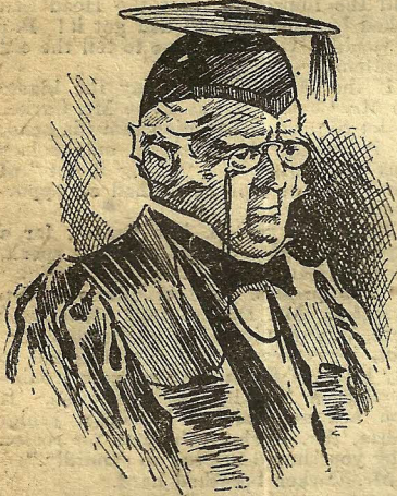
Dr. Chisholm, the Head of Rookwood, whose action in "sacking" Mr. Dalton causes a rebellion.

Mr. Carker left the Head's study with a frowning and grim brow. He was beginning to understand that his post at Rookwood depended on bringing the Fourth Form to heel; which was hardly fair on him. And even the measures he used were likely to be severely criticised by the Head as too rough and too ruffianly—though what other measures would serve his turn, the Head did not suggest. Mr. Carker gritted his teeth. At least, he would "take it out" of the rebel juniors, as soon as they were in his power—his hard, spiteful eyes glittered at that thought.