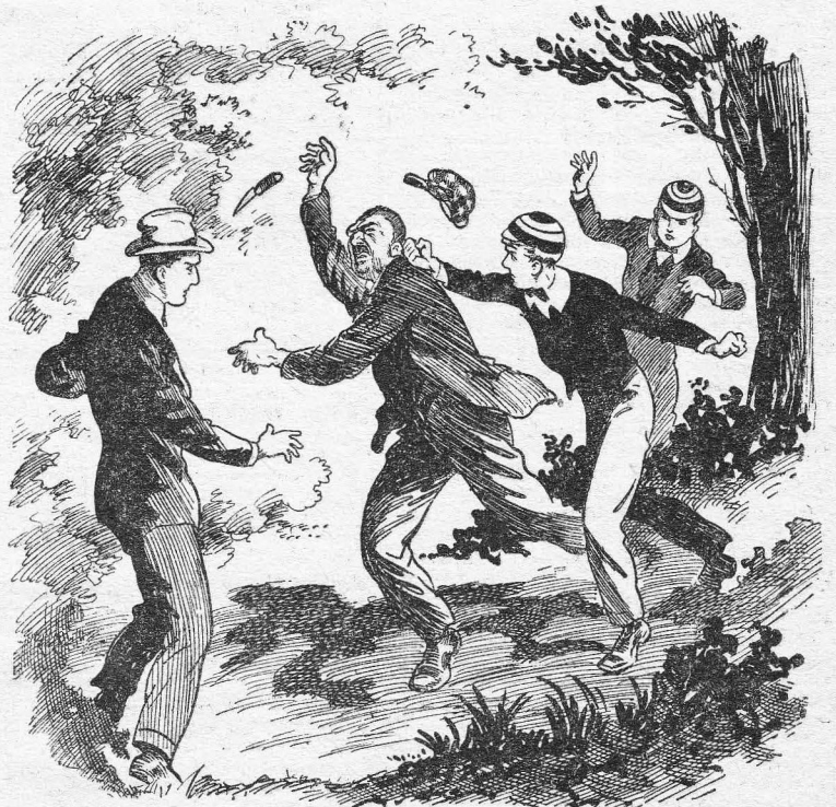
JIMMY SILVER'S PROMPT ACTION! Weapon in hand, the ruffian flung himself at the footballer. A moment more and the blow would have been struck. But in that moment Jimmy Silver acted. He sprang at the man and struck him on the side of the head with all his force.

Raby did not need telling that Mr. Smith's message was extremely unwelcome to Eric Wilmot, and that the footballer had no desire whatever to see his "old friend Smith."