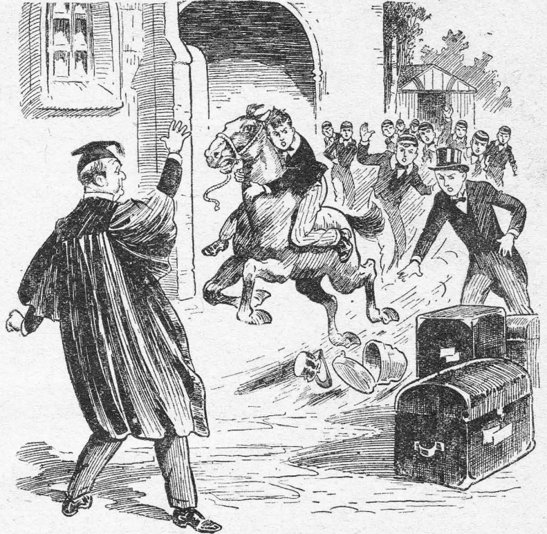
GUNNER THE HORSEMAN! Loud cries of alarm greeted the arrival of Trotsky with Gunner clinging convulsively to his back. The pony round a stack of luggage, and kicked over a hatbox belonging to Cardew. The box came open, and a silk topper rolled out on the gravel. At that moment Mr. Greely came upon the scene. "Stop!" he cried, holding up a hand.

Jimmy Silver & Co. were still on the march, with the miles lengthening behind them, when Tubby Muffin