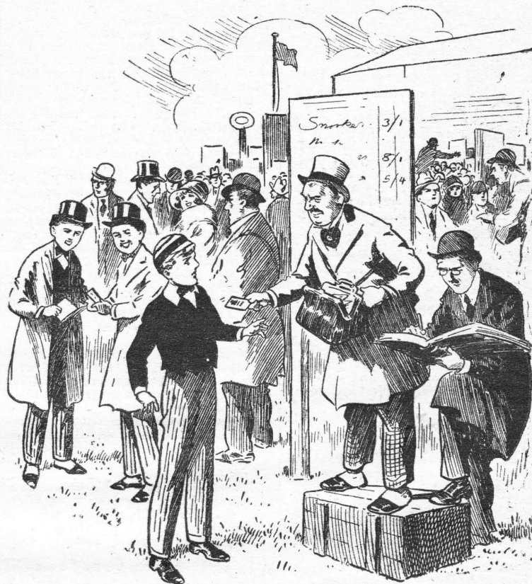
RABY BACKS A HORSE! After some hesitation Raby approached the bookmaker again with a pound note in his hand. "Snooker—" he began. The man mechanically took his money, and passed him a card, with which Raby retreated once more. He had taken the plunge now! (See Chapter 4.)

"Just as you like," said Townsend carelessly.