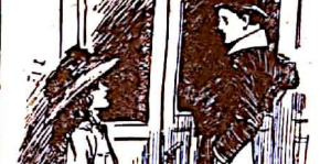
"As your eildah," resumed D'Arcy, "I should wegard it as my duty to look aftah you."